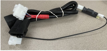
A-CD752-A 2021 RAM ProMaster Contact InterMotive for additional vehicle applications