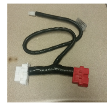
SBM Data Link harness "T's" into OBDII connector.

InterMotive, Inc. 12840 Earhart Ave. Auburn, CA 95602