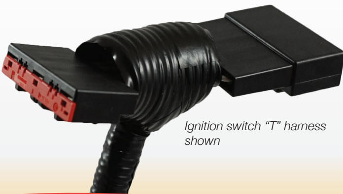
Ignition switch "T" harness shown

Product features may vary by make, model or year. See instructions for complete details.