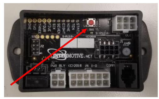
Press Test button to enter Diag. Mode