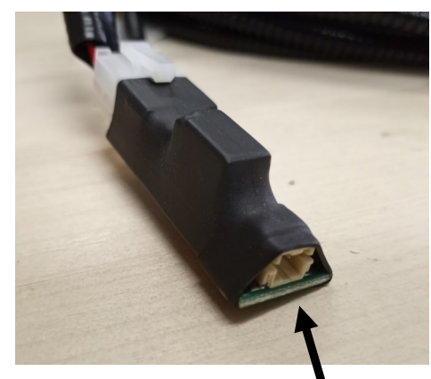
Plug OEM 2-Pin connector here