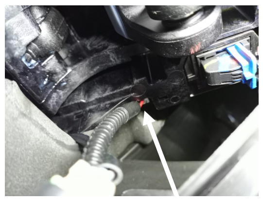
View from floor looking up at underside of transmission shifter PCB. Arrow points to the 2 pin Shift Lock Harness.

3. The A-AG752-11 kit provides a "T" Shift Lock harness which must be installed between the OEM harness and the shifter PCB. Locate the OEM 2-pin shift lock solenoid connector (located on the underside of the shifter). There is a layer of foam that will need to be repositioned to locate the connector and it may be necessary to cut an OEM zip tie. Pinch the connector tab, unplug it, and insert it into the A-AG752-11 mating connector. Plug the A-AG752-11 male connector into the OEM shift lock solenoid connector on the PCB.