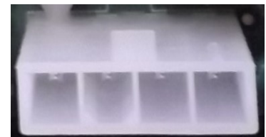
4 Pin MiniFit Connector