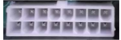
16 Pin Connector

WARNING DO NOT USE BLACK WIRE JUMPER VERSION!