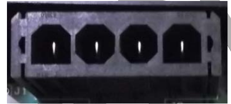
4 Pin Sabre Connector

PTM will provide Outputs for Left Rear Turn Lamp, Right Rear Turn Lamp and Brake. Each Output is Rated at 10 amp.