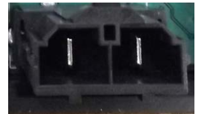
2w Minifit Sr

RED - Connect to direct 12V battery source.