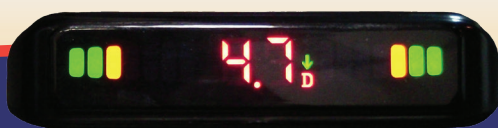
Camera and LCD display option